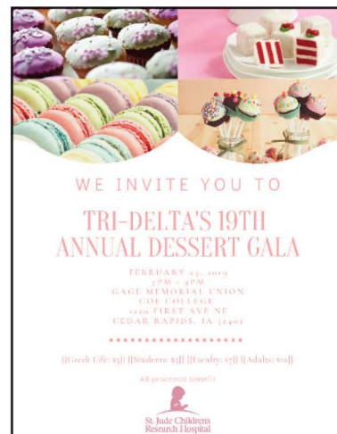
Event poster provided by Delta Delta Delta