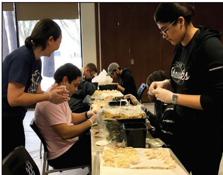
Kohawks prepare momo