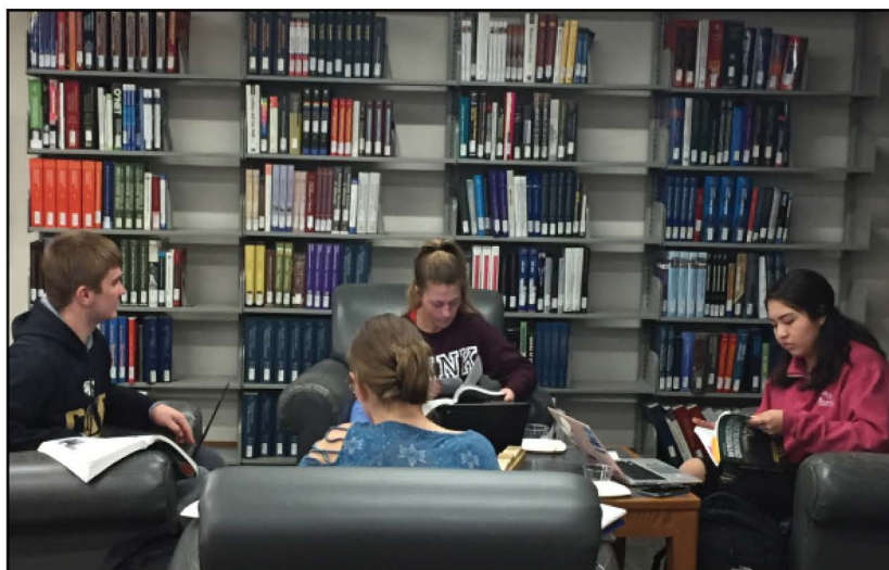
Students study together during Late Night Against Procrastination.