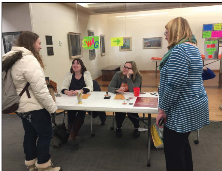
Staff welcome students to Stewart Library