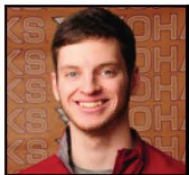
Caleb Rigdon Staff Writer

On Friday, February 22, the American Rivers Conference indoor track and field conference meet was hosted at Wartburg College in Waverly, Iowa.