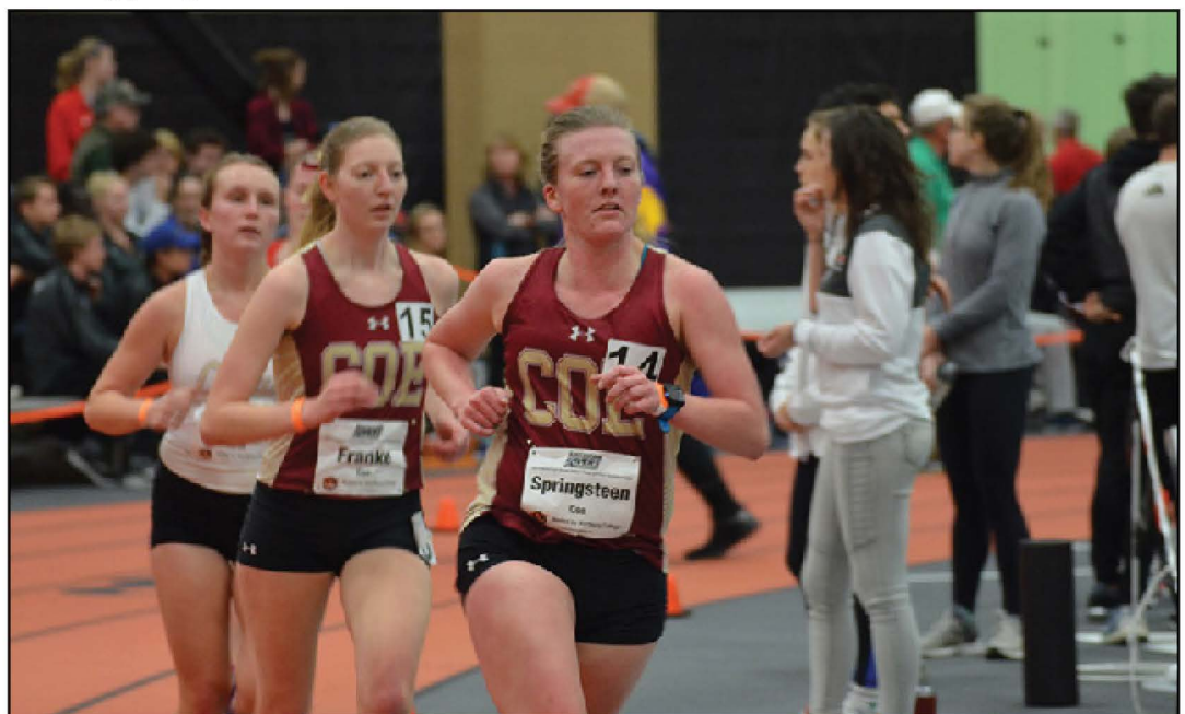
Coe athletes race around wartburg track at their meet.