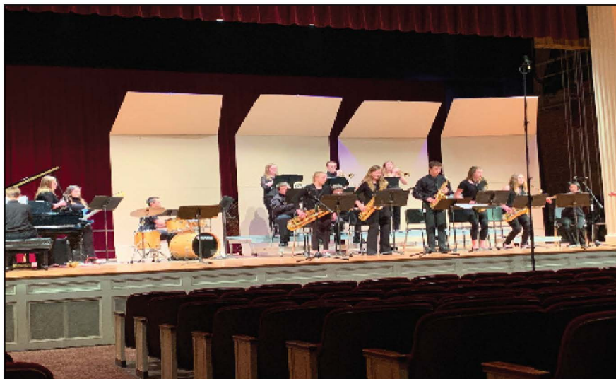
Jazz Orchestra Performs in Sinclair Auditorium