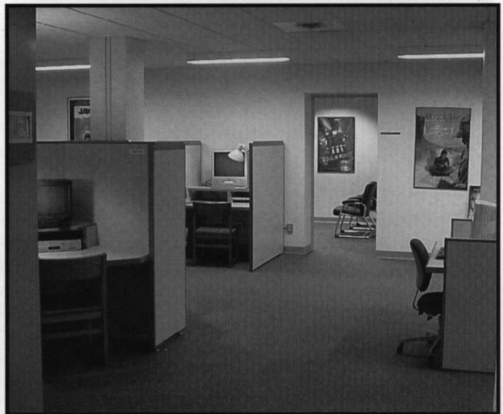
The library's basement, including the Audiovisual Department, is the beneficiary of new carpeting.