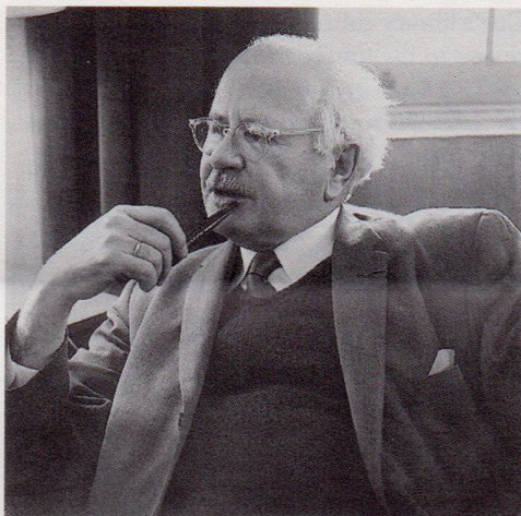
Author William L. Shirer, on a 1969 visit to Coe.

The Evening Union in Springfield, Massachusetts, concluded in a July 23, 1941 editorial: