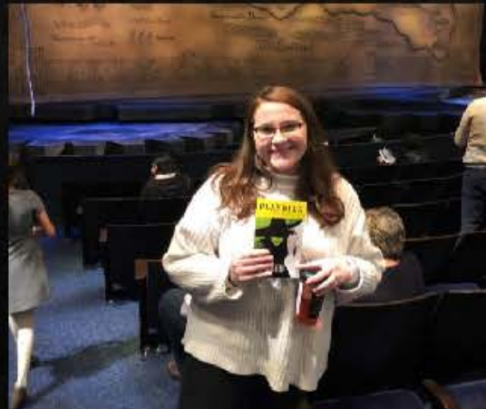
At Wicked on Broadway

I also had bought a Broadway ticket in advance, and I got to see Wicked this evening.