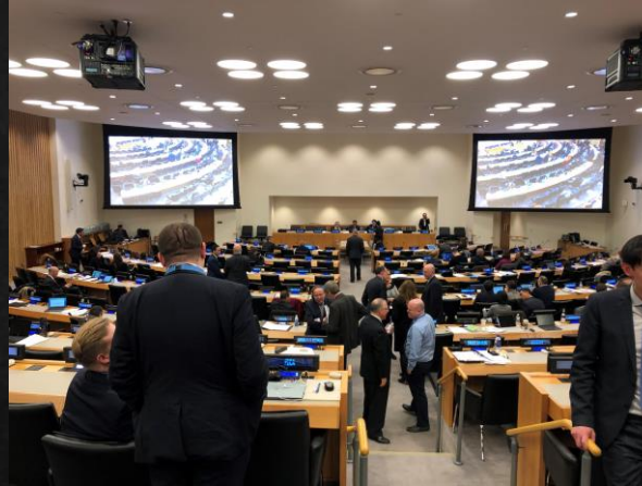
My view in the UN conference room

On Tuesday, most of this day of session continued the previous discussion regarding whether a single party can opt-out of the expedited process, when the other party wishes to continue with the expedited process.