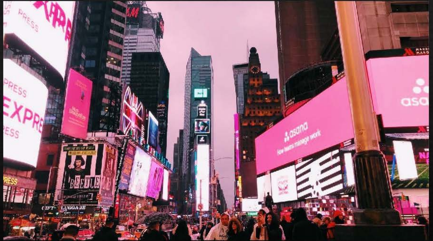
Times Square on Sunday night