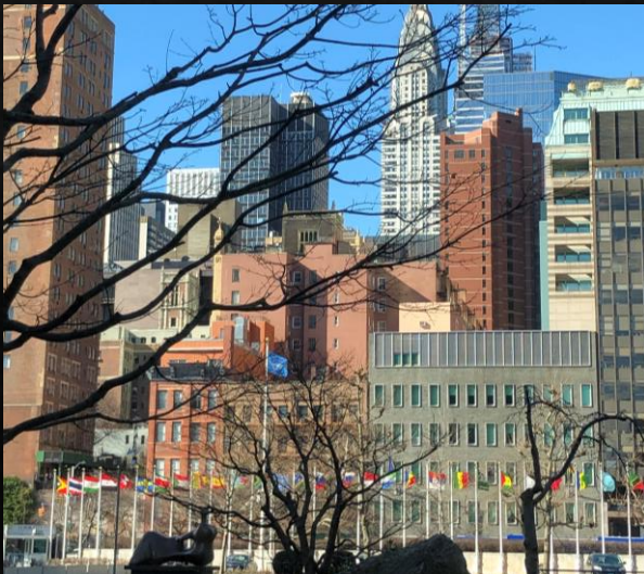
North view from the UN building

During this first day, there was a lot of discussion regarding the proposed UNCITRAL Expedited Arbitration Rules on whether there should be an opt-in or opt-out mechanism, and whether one party can opt-out when the other wants to continue with the expedited process.