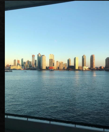
The view from the UN building overlooking the East River

The Working Group also discussed who would have the power to appoint the arbitrator or arbitration tribunal in international expedited arbitration cases.