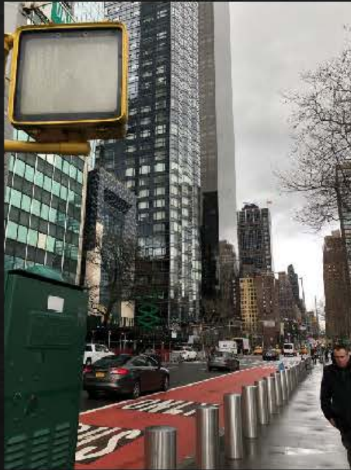
A street view of New York