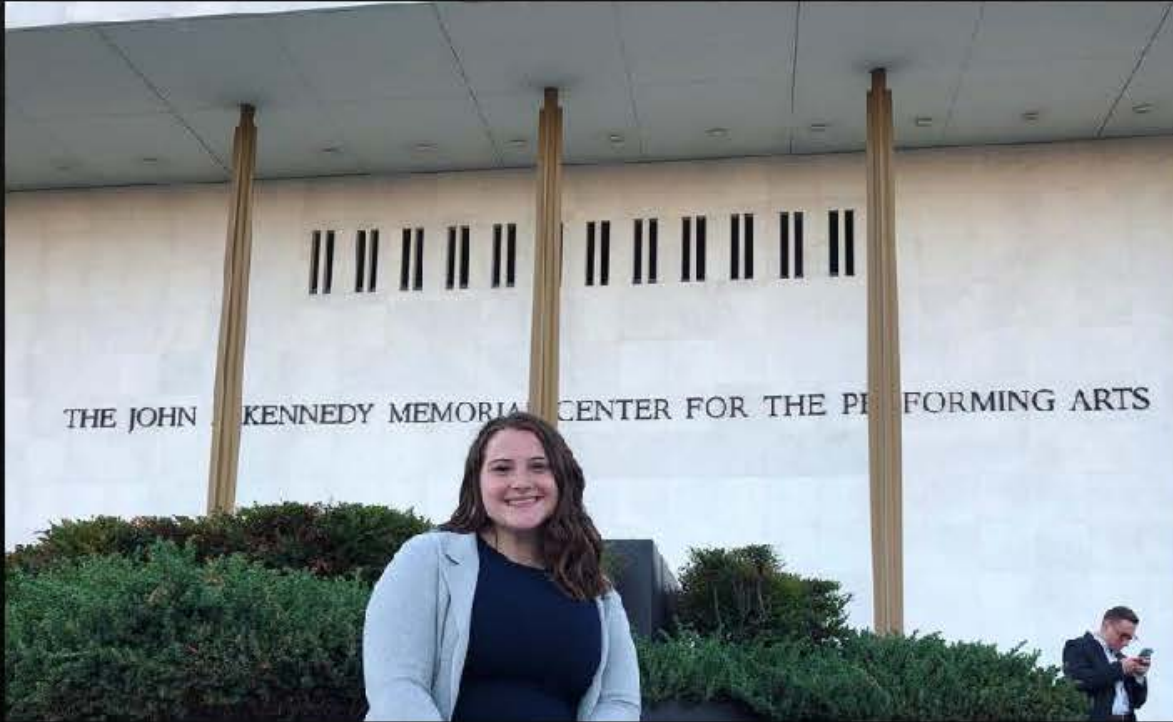
In Washington DC in front of the Kennedy Center last September