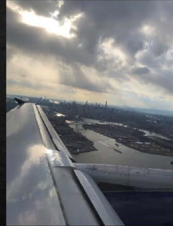
The view of New York from my plane window on the flight home