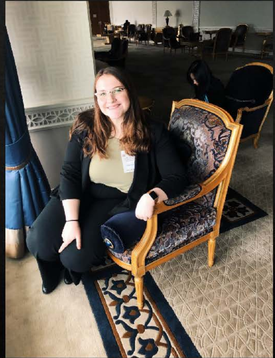
In the delegates lounge in the UN building in New York City