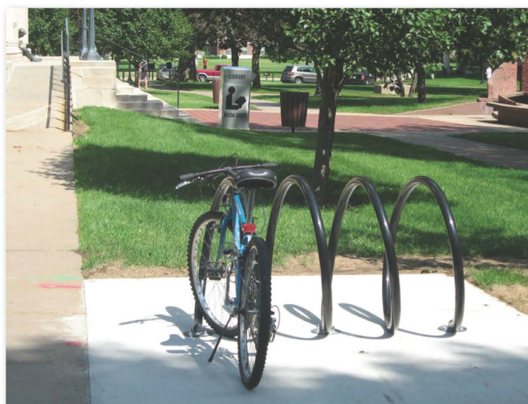
▲ Cyclists who formerly fastened their bikes to the library ramp railing have a stylish new place to park their wheels.