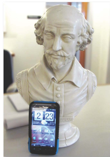
▲ The library’s new cell phone allows students to text or call the reference librarian with questions.

Today’s technology-fused educational environment offers new ways of creating and communicating knowledge, Jack emphasizes. “The media aspect of teaching and learning is advancing rapidly. All areas are using new media and becoming more dynamic. We’re trying to make that transition between older ways of teaching and new approaches, plus meeting students where they are when they arrive on campus.” ■