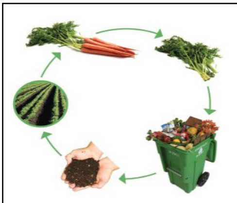
The process of composting food and its benefits.