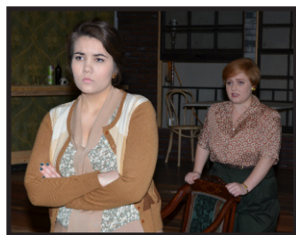
POLITICS AT PLAY P. 4