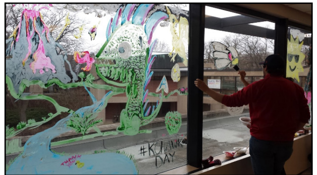
Left to right: Admitted Students Weekend, March 31 & April 1. Duchess, a student band, opened for Icona Pop on March 31. Students participated in window painting over the weekend for A Day of Giving.