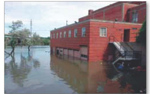
▲ The historical June flood reached Coe's Physical Plant building on the northwestern corner of the campus. As all power for the main campus is routed through that location, most of the campus was without electricity from June 12 through June 20, and the damaged electrical system went off again from July 11 through July 14.

"Obviously, given the magnitude of the disaster, we cannot interview everyone impacted by the flood, so we hope to interview a sampling of individuals, citizens, business people and civic leaders," says Jack.